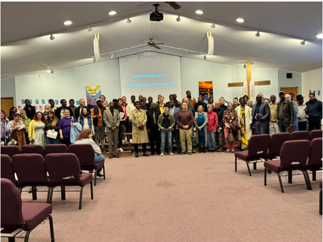
Nazarene Church, Event of April 26, 2025 Prayer for needy population

English & HiSET (GED) Tutoring Available