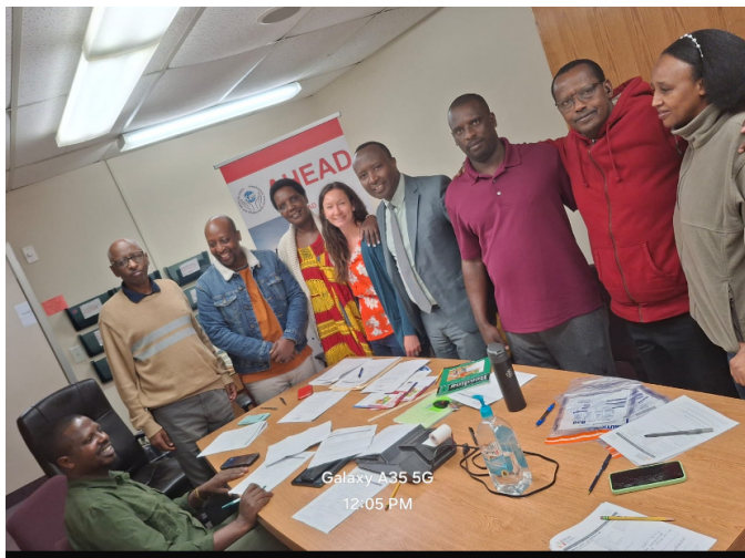
Launching of the ESL program at Nazarene Church Bangor ME May 10, 2025

AHEAD has noted that tutoring builds confidence in the learners and prepares them to succeed.