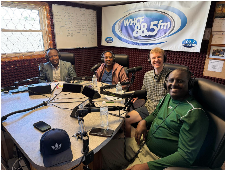
Leadership of Nazarene Church, Bangor ME lead a talk on advancing Literacy, ESL and Adult education.